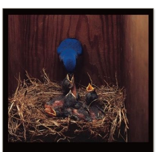
We Love our Bluebirds

Websites Tennessee Bluebird Society <u>www.tnbluebirdsociety.org</u> North American Bluebird Society <u>www.nabluebirdsociety.org</u>